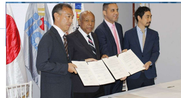
ENRI/Agri / Inicio /