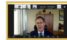
PETER BUTTON Vice Secretary-General of International Union for the Protection of New Varieties of Plants (UPOV)