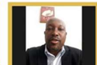
HON. SABOTO CAESAR Minister of Agriculture, St. Vincent and the Grenadines