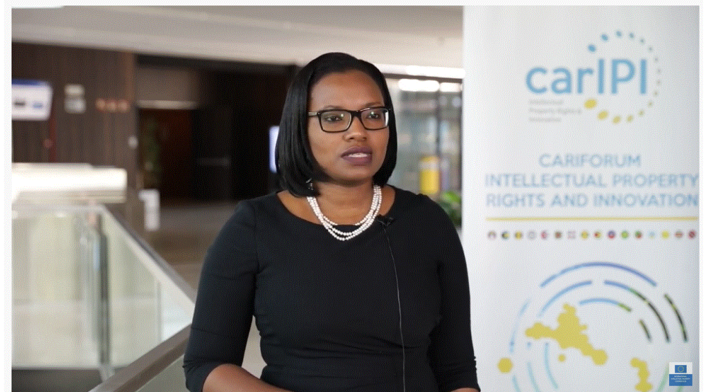
CarIPI - What is TMClass?