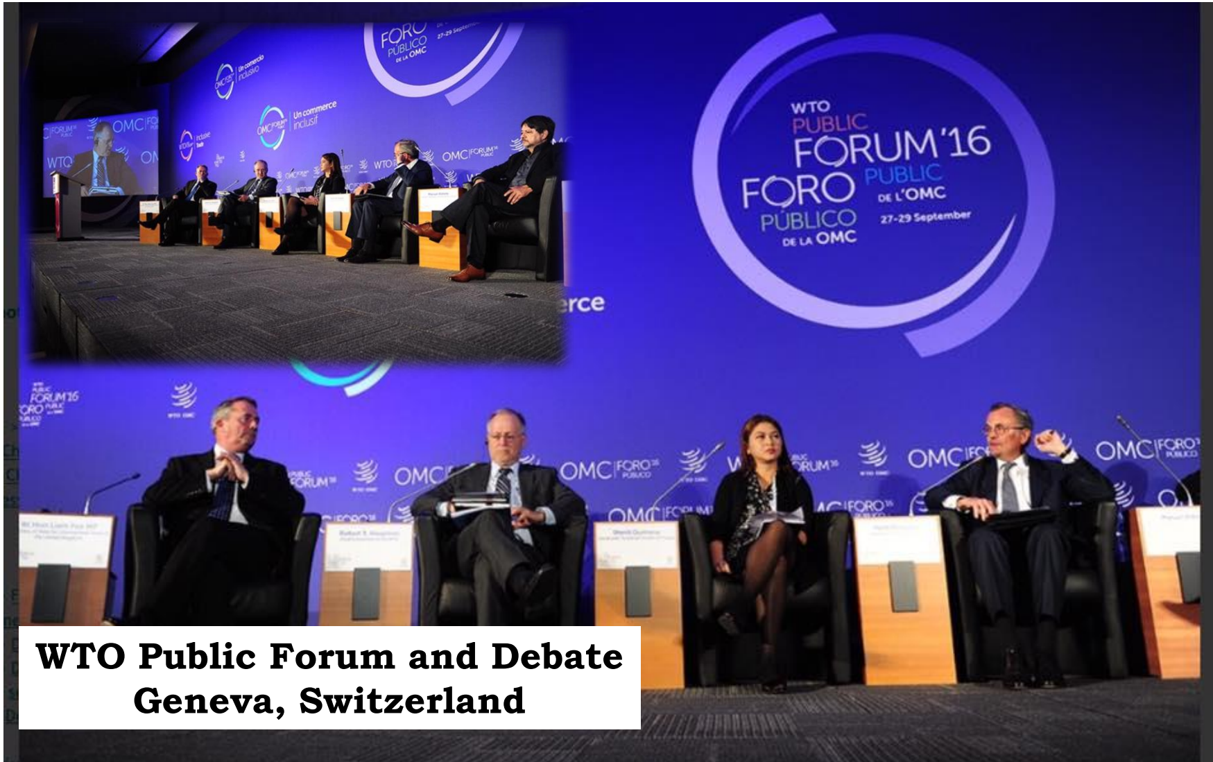
WTO Public Forum and Debate Geneva, Switzerland