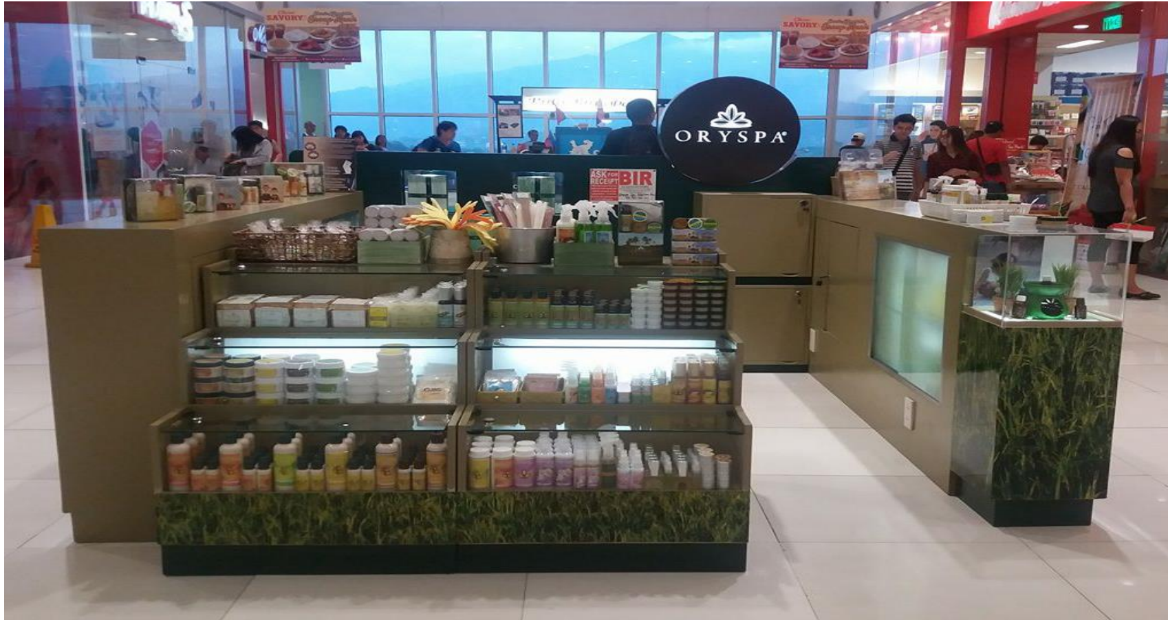
Oryspa Store located at SM Calamba City Laguna. 1 ST Oryspa branch and was launched in 2010.