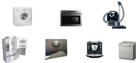
Household appliances (class 07-99)