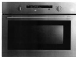
cooking appliances, utensils and containers (class 07-02)