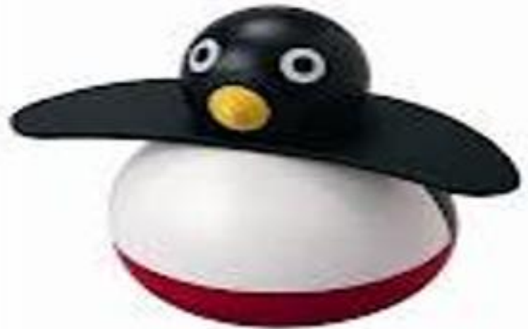
Product indication: Cars

In the event of no product indication or obvious mismatch - objection