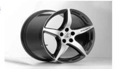
Vehicle wheel rims 12-16