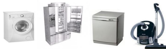
washing, cleaning and drying machines (class 15-05)