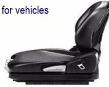
Seats for vehicles 06-01

Product indication must allow classification of the design in a single class*