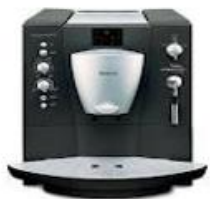
appliances for preparing food and drink (class 31-00)