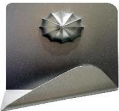
appliances and utensils, hand-manipulated, for preparing food or drink (class 07-04)